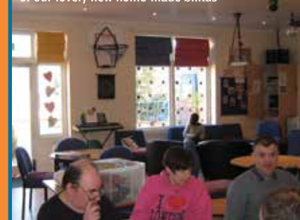
Deciding on the activity schedule in front of our lovely new home-made blinds

A big thank you and well done to everyone who helped create our new blinds. It was a brilliant effort by both staff and the people we support. The new blinds not only look professional but are lovely and bright. The patterns and colours were all chosen by our individuals at the day centre. Well done all!