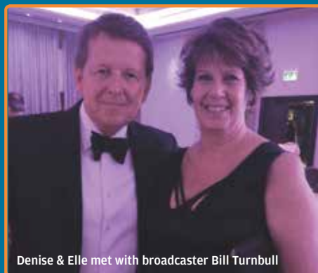
Denise & Elle met with broadcaster Bill Turnbull