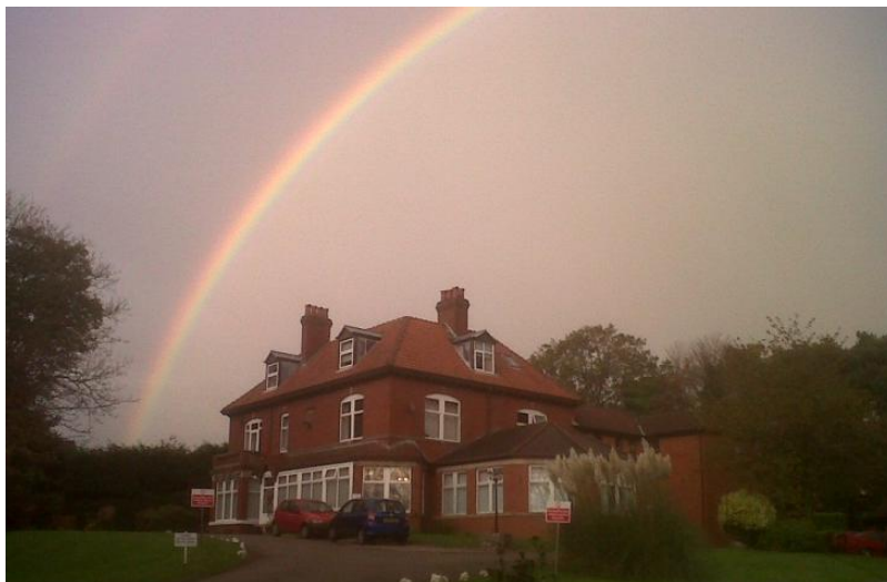
Burrowbeck Grange Nursing Home